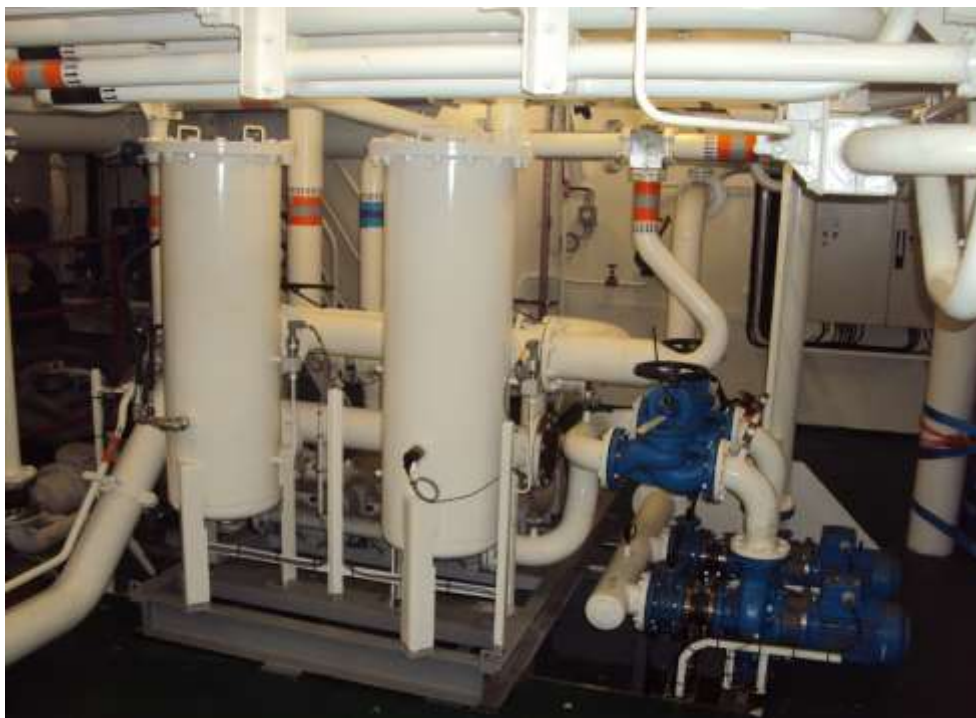
A view in the E.R.; one QSK50 Cummins is installed in the ER.,